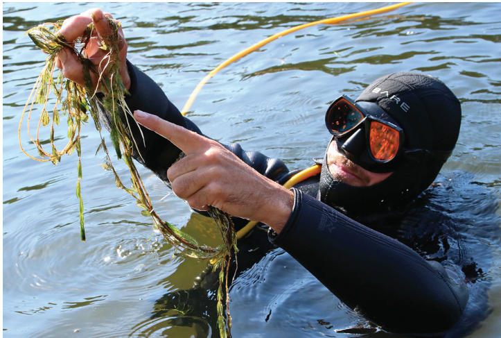
A scuba diver pulls invasive Eurasian watermilfoil in Moody Pond.

Staff, partners, volunteers and contractors searched for invasive species in 42 New York State Department of Environmental Conservation (NYSDEC) campgrounds, over 110 recreational access points (such as trailheads and boat launches), sections of over 30 Forest Preserve units and 40 state and county road corridors in 2022. Nearly 500 new terrestrial invasive species infestations were found, bringing the total number of mapped infestations in the Adirondack region to 7,165.