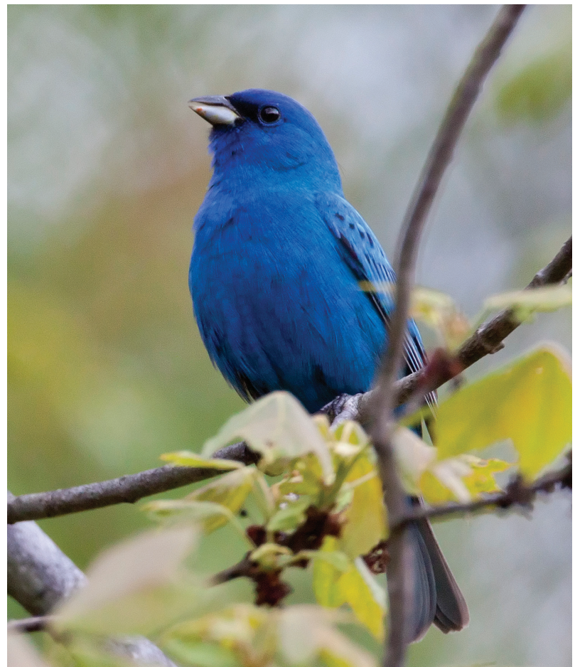
Indigo Bunting. © Larry Master