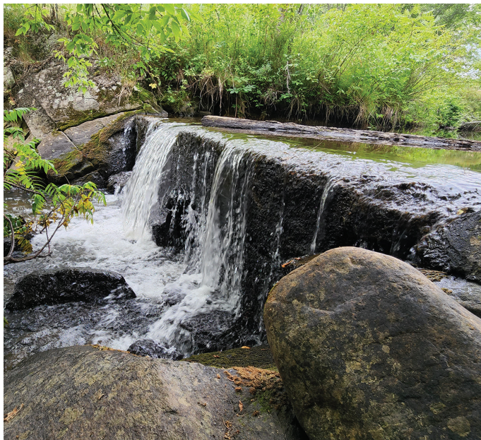
The Nature Conservancy and partners are working to reconnect blocked waters throughout the Boquet River watershed to restore migratory fish habitat, reduce community flooding—and let the river run.

The Conservancy and our partners removed the Reber dam last fall, immediately reconnecting an estimated six miles of habitat for coldwater fish to the North Branch of the Boquet River.