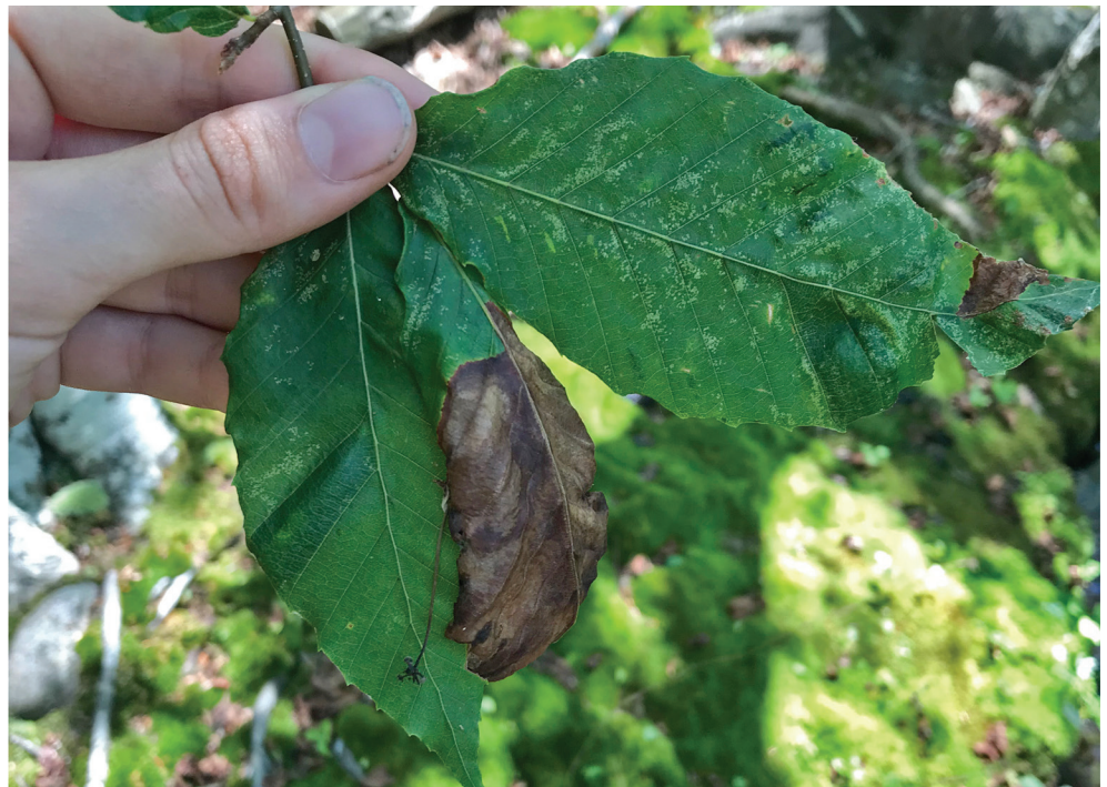
Beech leaves with signs of BLD.