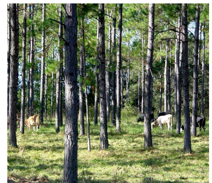
Silvopasture: Integration of trees and grazing livestock operations on the same land.