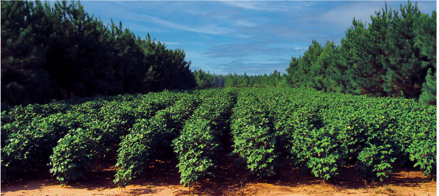
Cotton grows between rows of pine trees.

FOR PRODUCER PROFITABILITY AND CLIMATE STABILIZATION