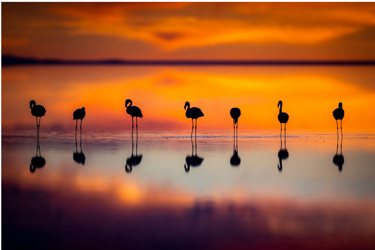
REFLECTIONS Andean flamingos in sunset silhouette at the Uyuni Salt Flats in Bolivia.