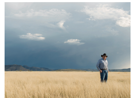
Ranchers have an enormous opportunity to address some of the greatest environmental challenges facing the world today: water, biodiversity and climate.

At scale, virtual fencing may unlock the use of practices that regenerate land health and help address climate change and biodiversity loss.