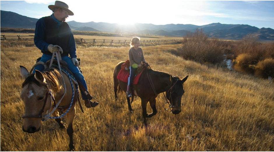
Ranchers are among our greatest allies in conservation. The owners of the Alderspring Ranch in Idaho manage their land with conservation practices that help to protect a stretch of the Pahsimero River that contains as much as 40 percent of the chinook spawning areas for the entire river.