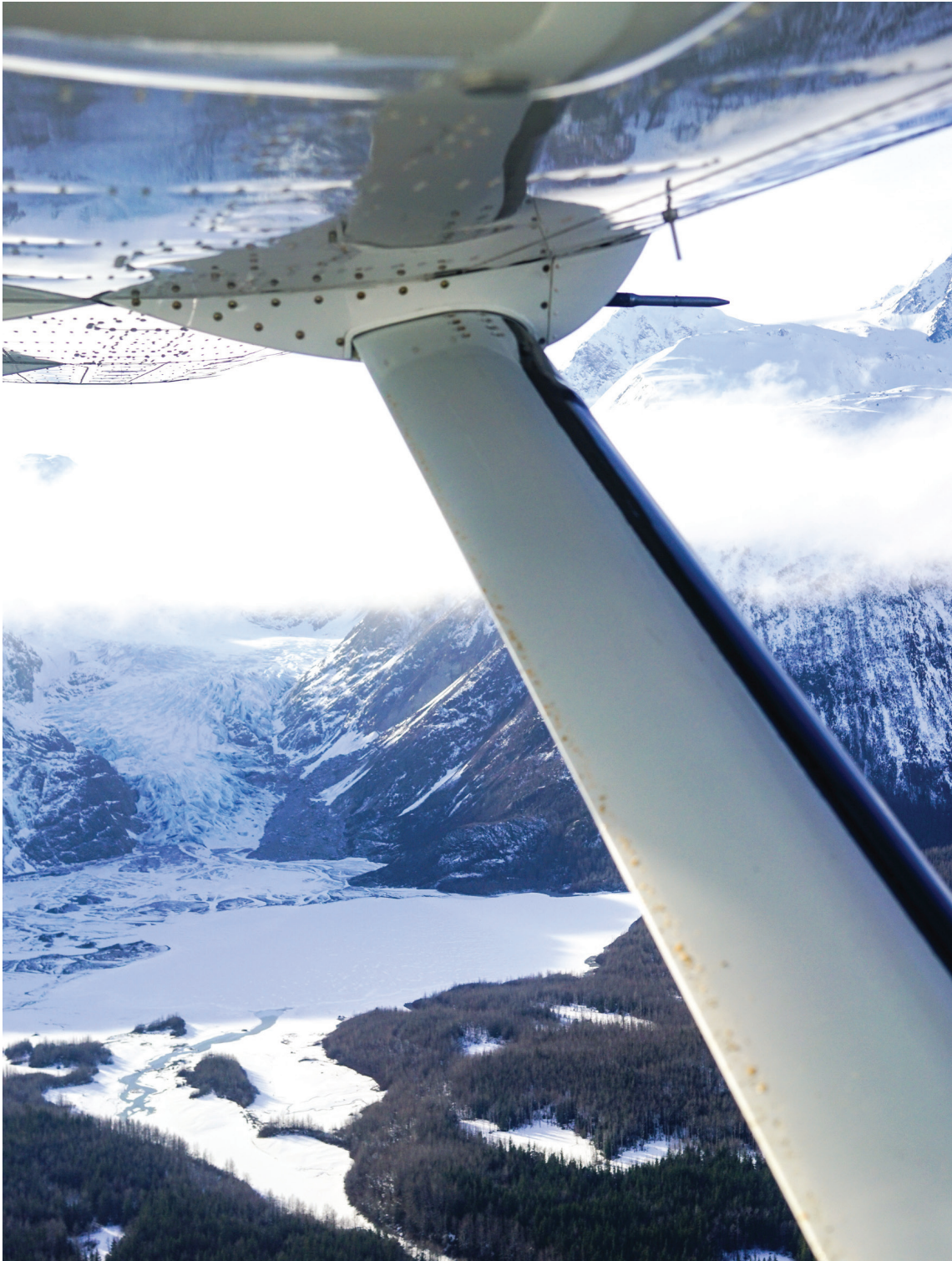
The view while flying from Sitka to the Farmers Summit in Haines.