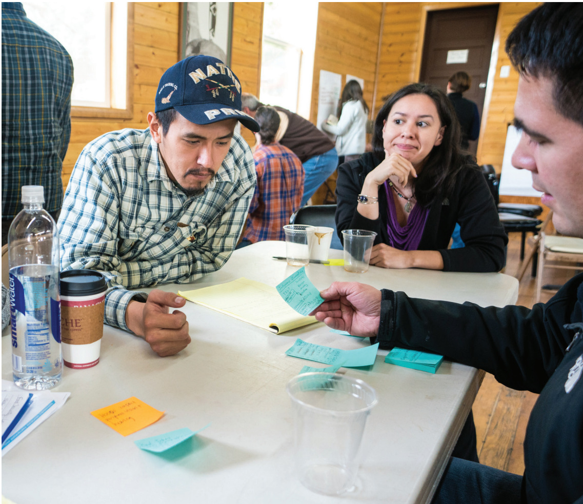
Participants gather for a breakout session during SSP's October 2017 retreat in Yakutat.