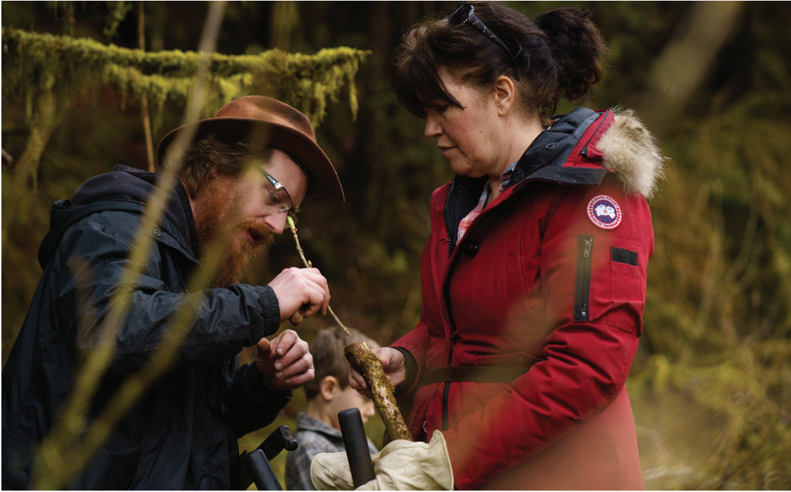
Participants in Health Hikes learn how to harvest and explore the uses of Devil's Club near the village of Kasaan.

Ten years ago, the founders of SSP endeavored to forge a new vision for resource management and community-based economic development in Southeast Alaska. This vision centered around advancing the priorities of the region's communities, while also emphasizing the importance of regional collaboration across organizations and interest groups that had previously been at odds with one another. The evidence presented in this report supports the conclusion that SSP has so far succeeded in advancing this new vision in measurable ways, at both community and regional levels. Work remains to be done to build upon the positive changes in the overarching outcomes identified by SSP's regional leaders. While the region has made great progress since 2009, the survey results in Chapter 2 reveal that these overarching outcomes are still well below their highest possible levels. The increased collaboration advanced by SSP's work can provide a firm foundation on which to continue to build, refine, and develop this new vision.