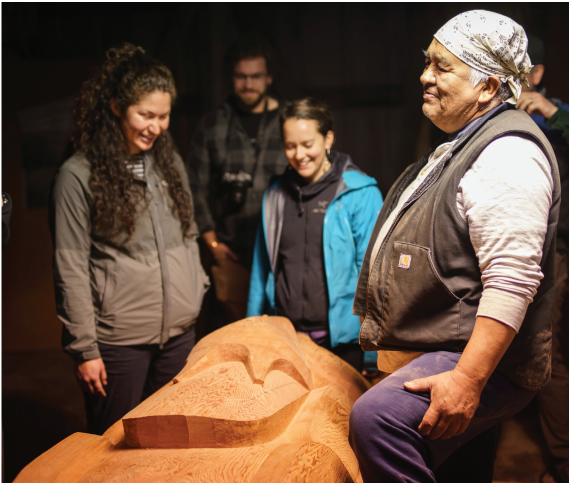
SSP participants gather around a wood carving in progress during the 5th annual 2018 retreat in the community of Hydaburg.

through collaborating with local schools to host the greenhouse and build curriculum around food gardening. One focus group participant in Hoonah, a student in one of the local schools, cited Moby as having taught him to grow chives, kale, sunflowers, and tomatoes, which he shared at family dinners. A focus group participant in Kake cited Moby as an example of increasing community empowerment through revitalizing local food, possibly leading to entrepreneurship: “I think rewiring people’s mindsets to think about growing your own is something that we have been witnessing... Empowering people to think, ‘I could do that. I could make money from that.’”