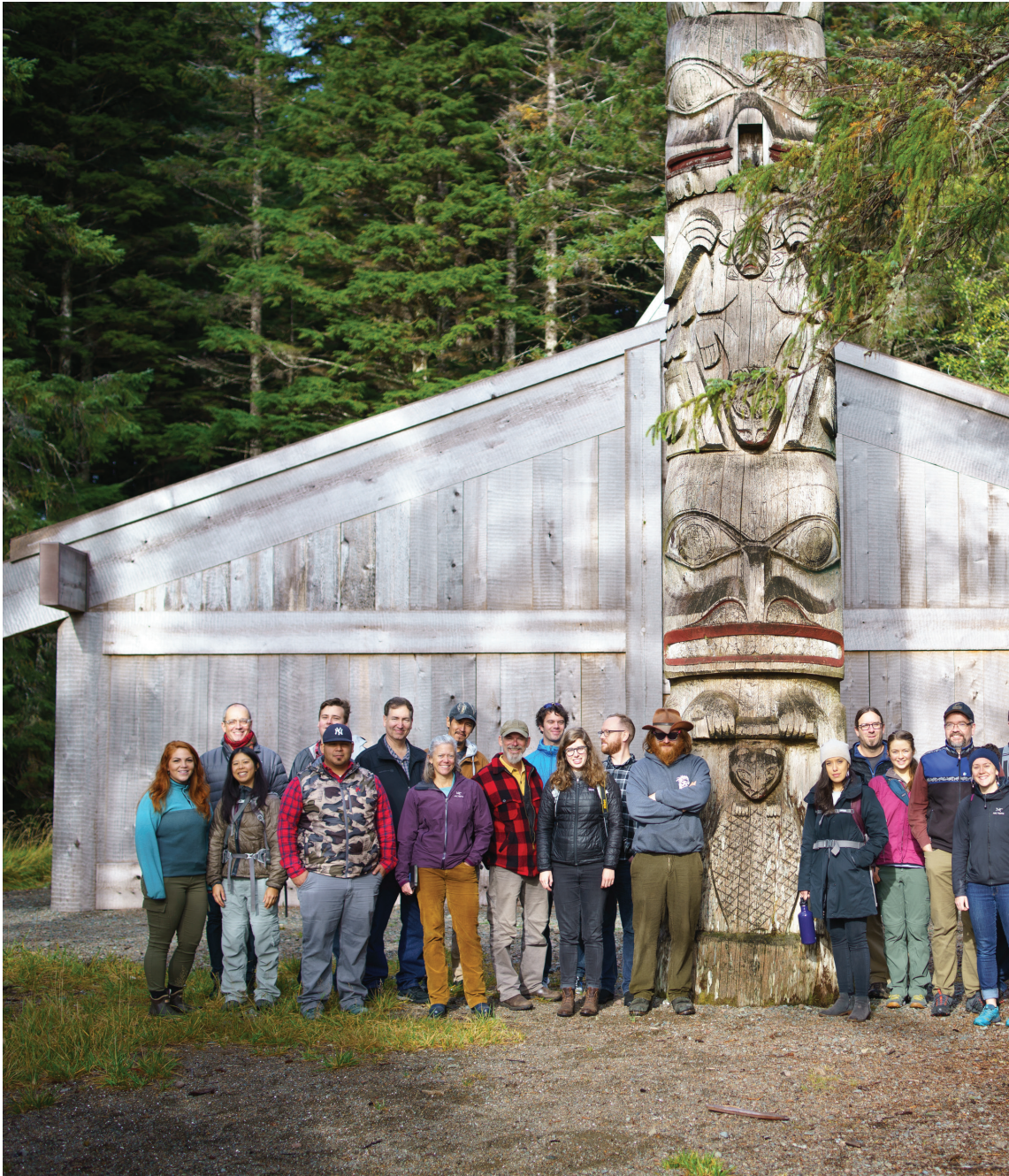
Above: Participants in the 2018 SSP Retreat on Prince of Wales Island visit the Whale House in Kasaan.