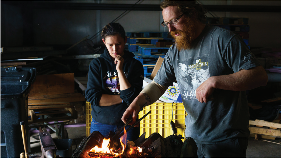
An instructor demonstrates a method of metal working during a TRAYLS training.

Age diversity was also similar to the Community Survey. Given category ranges from “18-24” to “Over 75,” the largest group of respondents were in the 25-34 range (8 out of 20), followed by the 35-44 age range (5 out of 20) and then the 55-64 age range (4 out of 20).