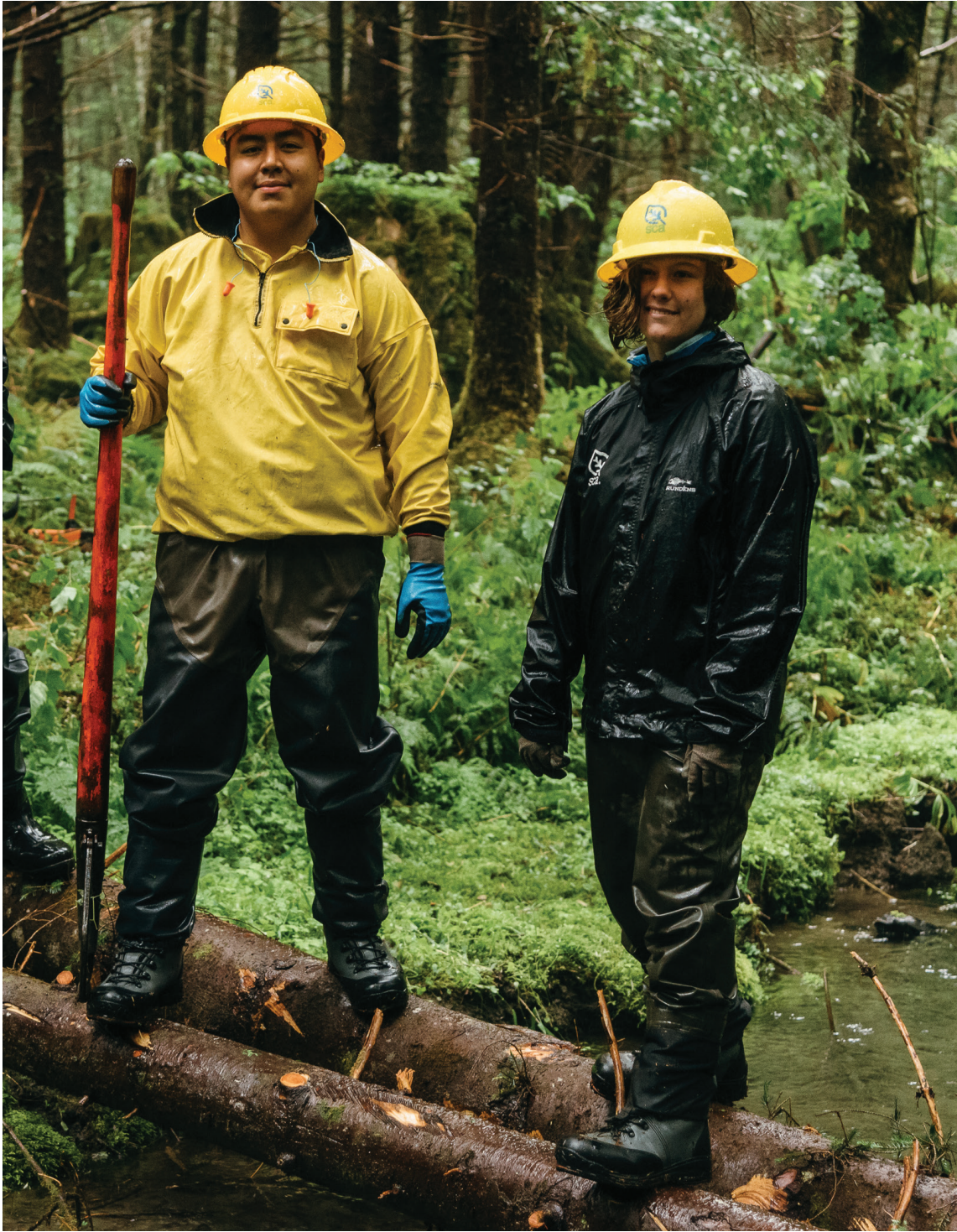
Members of TRAYLS (Training Rural Alaskan Youth Students and Leaders) pause for a picture while working on a stream restoration project near Sitka.