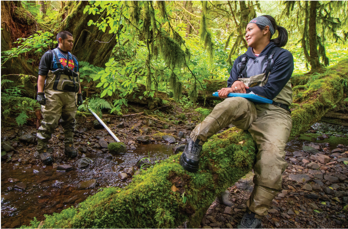
Members of the Hydaburg Stream Team assessing the conditions of salmon-bearing streams on Prince of Wales Island.

from SSP by the community-based host organization ($40,810). The host organizations use this funding to employ the Community Catalyst. For the regional level, this attribute was set at the level of the annual total general support received for the entire SSP network ($760,000). The SSP network uses this funding to support the Community and Regional Catalysts, host the bi-annual retreats, and support program administration and communications. For a more detailed description of the swing weighting methodology, see Chapter 4.