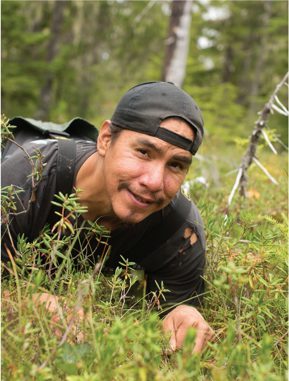
A Hoonah Native Forest Partnership crew member conducting vegetation surveys.