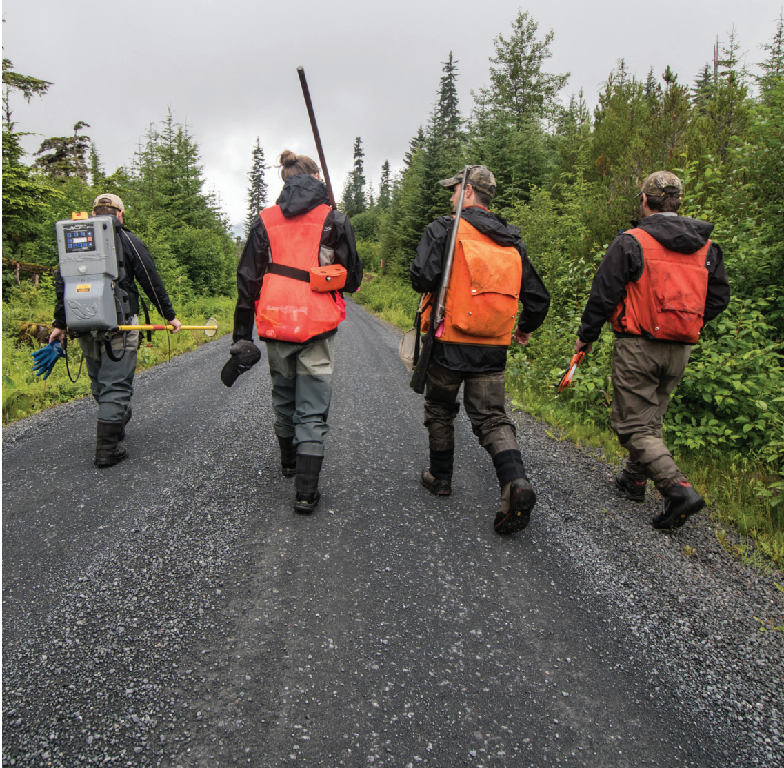
Members of the Hoonah Native Forest Partnership (HNFP) set out into the field on their way to conduct fish surveys.

As noted in the previous chapters, SSP works on two levels simultaneously: within communities, to promote a range projects and programs based on each community's self-identified priorities; and across the region, to promote cooperation and solutions across stakeholder groups, from conservation nonprofits to Alaska Native corporations including those that conduct timber harvesting. Thus, similarly to the surveys that asked different groups of stakeholders to measure community and regional changes in overarching outcomes, we ask different groups of stakeholders to weight the relative importance of those changes at the community and regional levels. We asked those whose work focuses on regional-level solutions to weight the importance of regional changes, and those whose work focuses on community-level solutions to weight the importance of community-level changes.