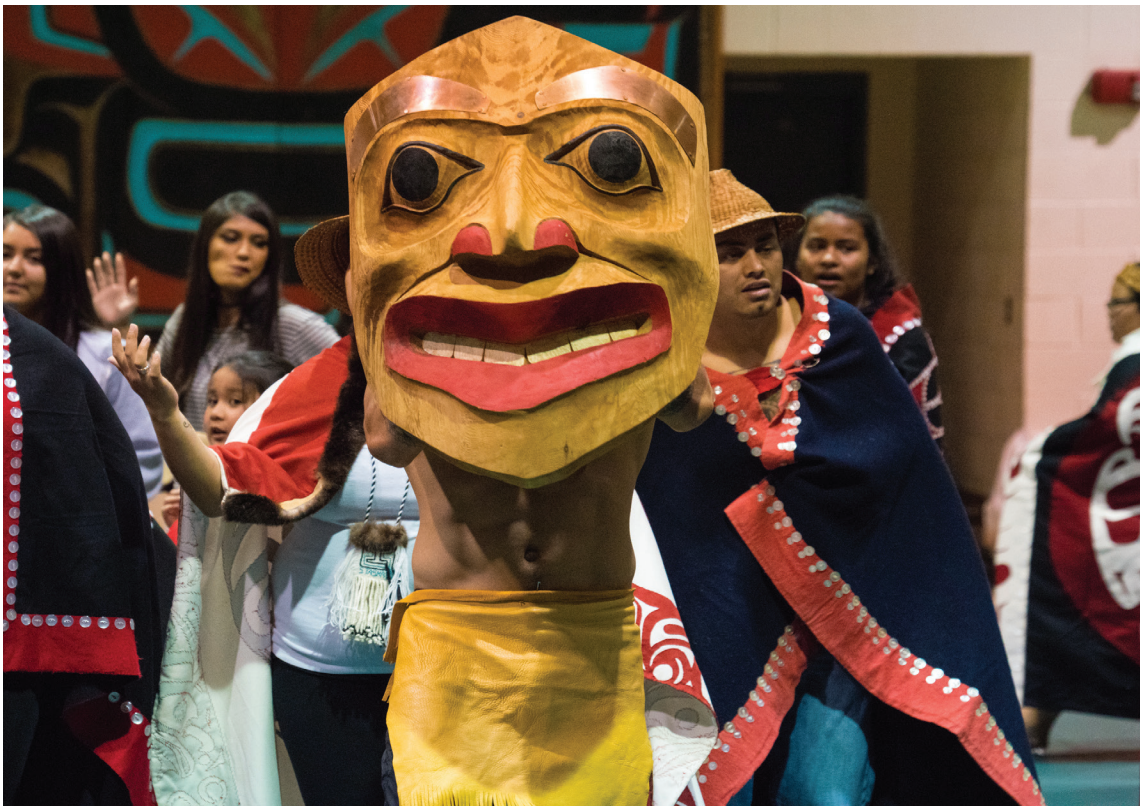
(Top) A group of students tour a biomass greenhouse in Kasaan. (Bottom) A dancer at the Hydaburg Culture Camp performs wearing a large wooden mask.