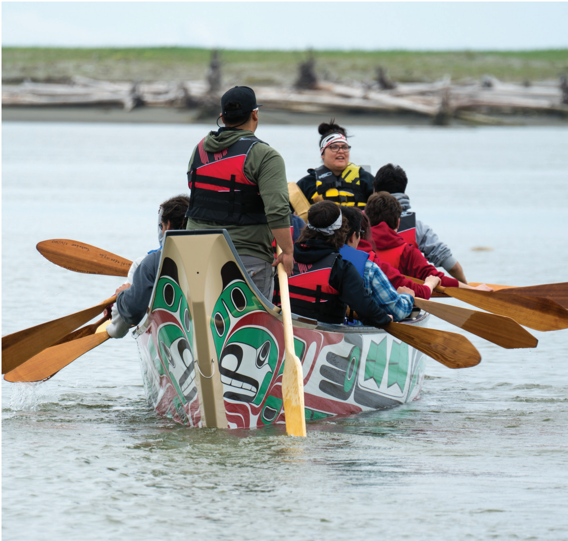
Participants in the 2017 Yakutat Culture Camp enjoy a canoe trip in the waters near Yakutat.

“SSP can show that working together isn’t just limited to people and organizations. It’s the whole ecosystem of Southeast Alaska: What are our resources? What are our strengths? What can we build upon? ”