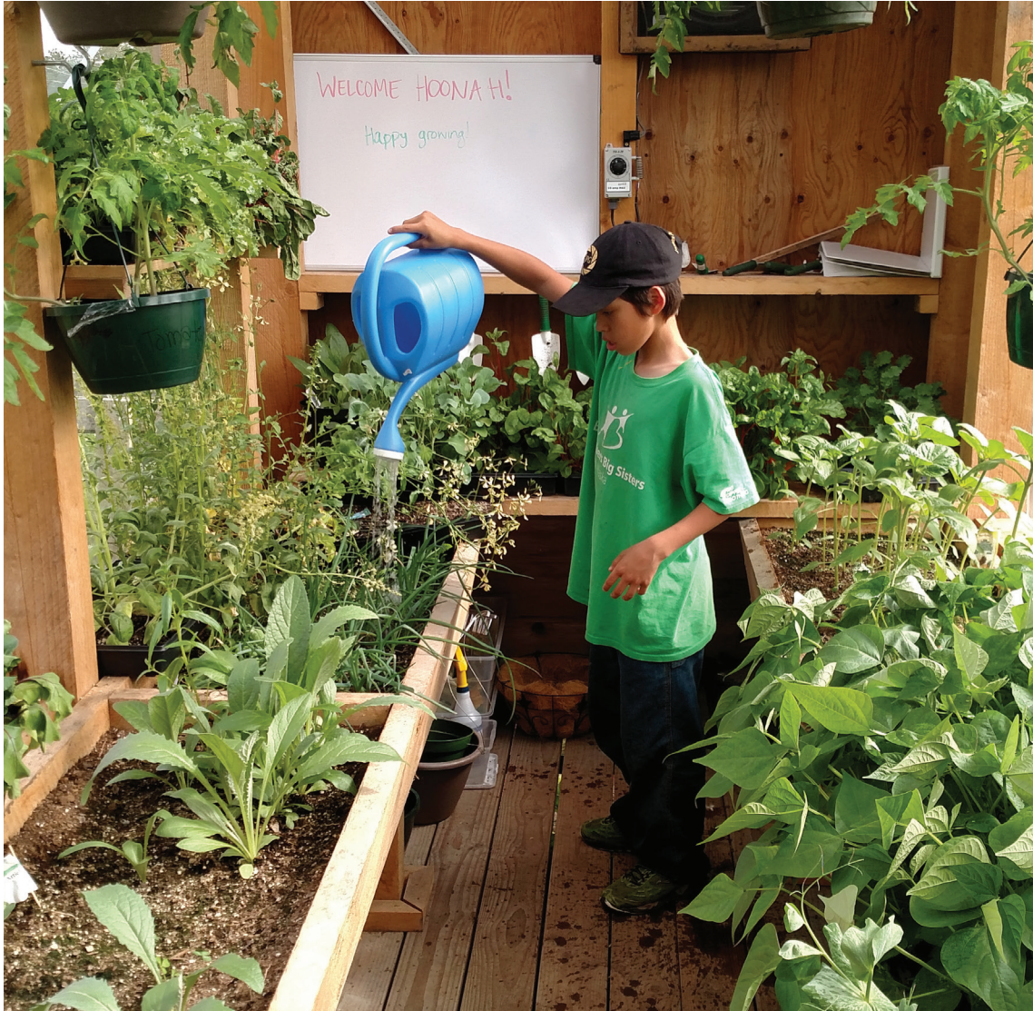
A student waters vegetables in MOBY the Mobile Greenhouse during a stop in Hoonah.