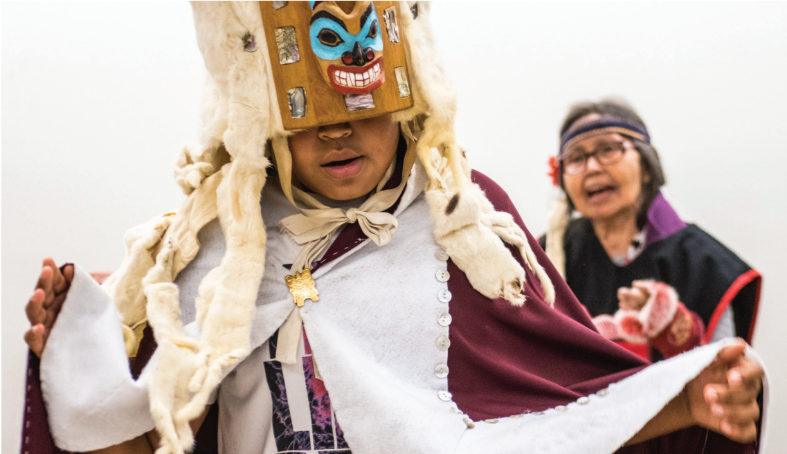
Dancers perform during an SSP retreat in Hoonah.

on community-based development. This group received a survey that asked them to rate the levels of the overarching outcomes prevailing in their community only. The second group included residents of SSP's target communities whose work included both community-based and regionally based development. This group received a survey that asked them to rate the levels of the overarching outcomes prevailing both within their respective communities and throughout the region. 3 Finally, one regional stakeholder took the Regional Survey only, since they did not live in an SSP target community but had a clearly defined mandate to work across the region.