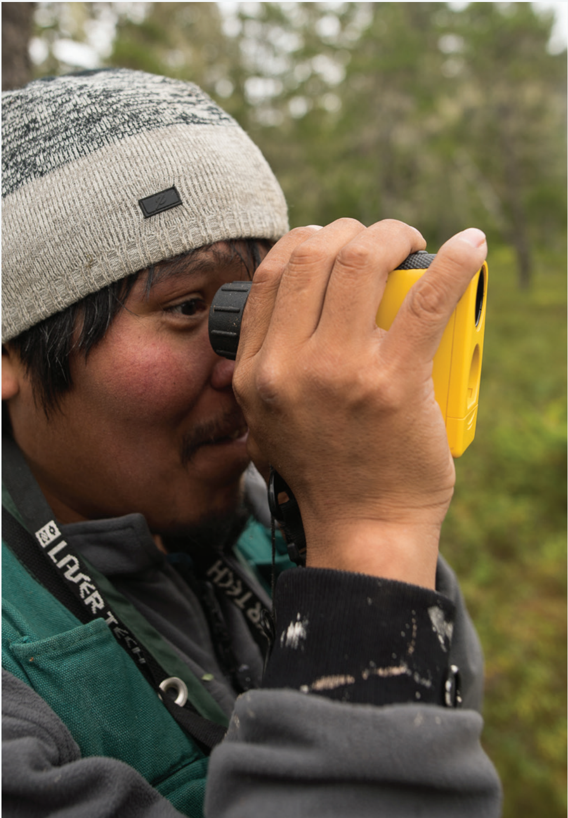
A crew member working with the Hoonah Native Forest Partnership uses a laser to take a tree height during vegetation surveys.