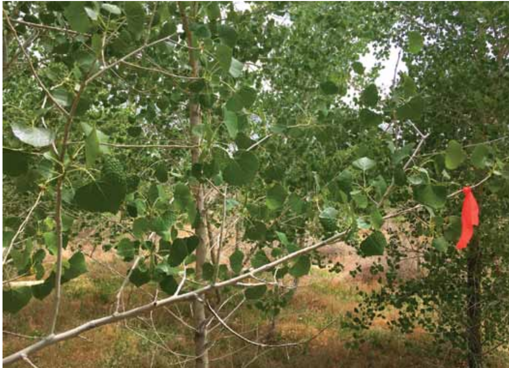
Small holes in the cottonwood leaves simulate insect attacks.