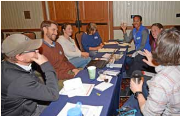
Attendees at the November 2019 Forum.

CONTACT: canyonlandsresearchcenter@gmail.com