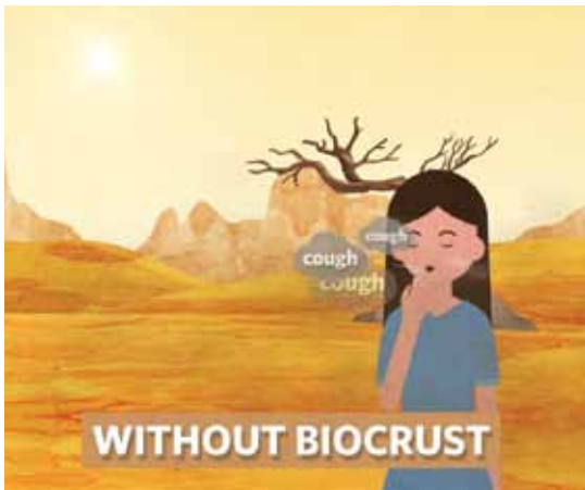
Biocrust illustration