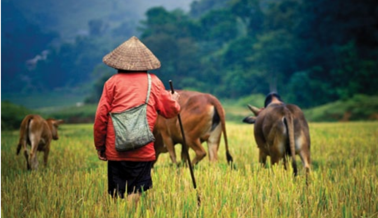
Buffalo shepherd on the rice field.

The foundation of the project was the passage of the Community Forestry Sub-Decree (2003), a law allowing communities to secure 15-year renewable management rights for community forest areas. The 13 community forests have created management plans and applied to the Forest Administration for legal recognition.