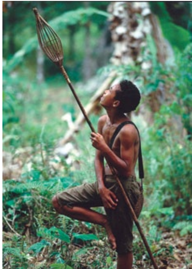
Nutmeg harvesting in Maluku, Indonesia.

A good example of the need for incentives across multiple levels is the beef sector in Brazil, outlined in Table 1. At the national level, Brazil has in place a command-and-control regulation that requires landholders in the Amazon to maintain 80% of their land in forest cover. This law has been on the books for years, but recently the federal government has begun a serious enforcement effort to ensure that landholders are complying. As part of this push, the national government published a list of the municipalities in the Amazon with the highest deforestation rates and cut off credit lines for those jurisdictions. This move effectively spurred state and municipal