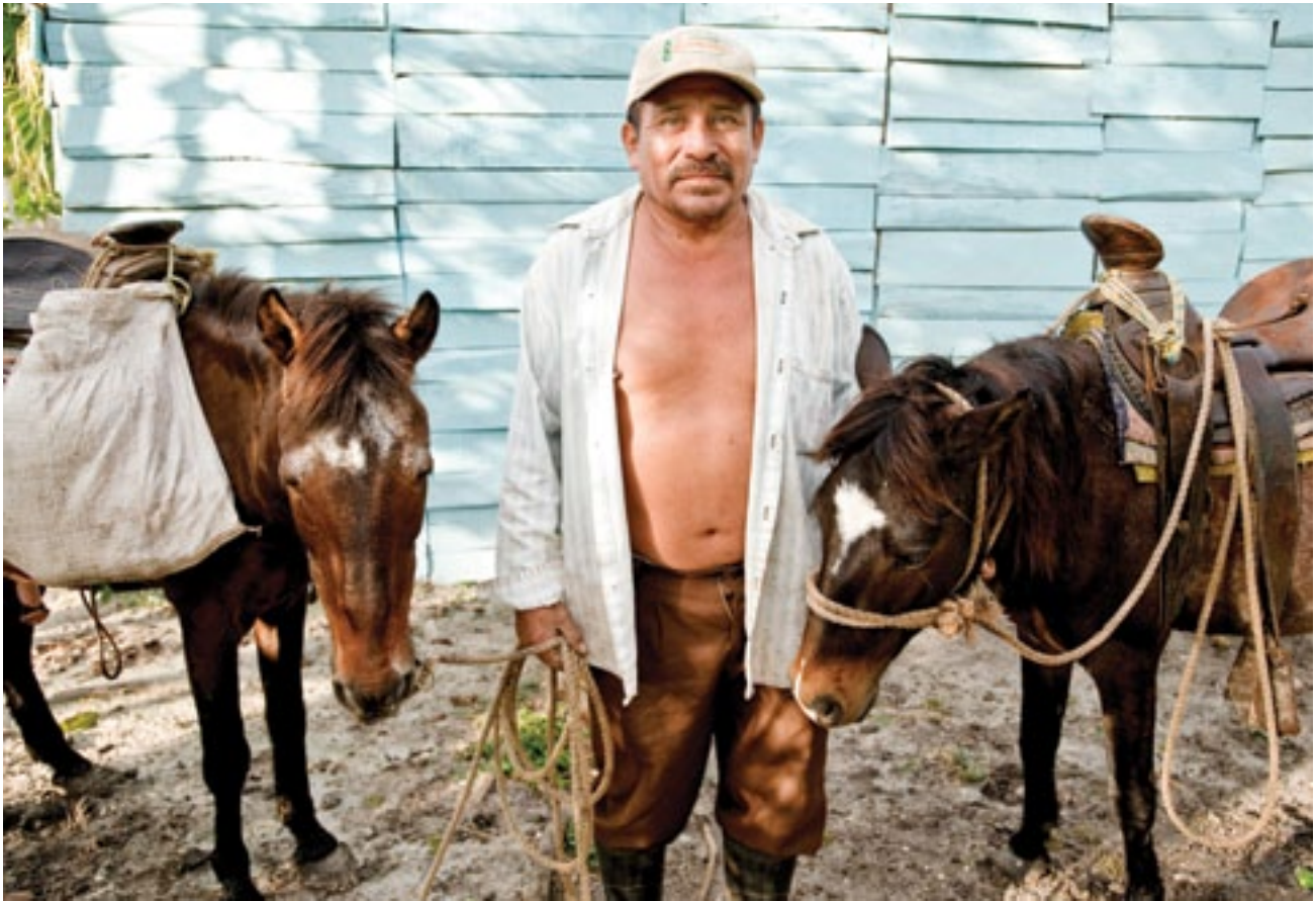
A chiclero stands with his ponies outside his home in the ejido Veinte de Noviembre, situated in the Maya Forest of Mexico's Yucatan Peninsula.