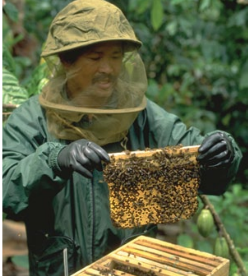
Beekeeping is a micro enterprise in Kamarora, Sulawesi, Indonesia.

KDP's primary expense (80 percent) were the community block grants delivered to participating kecamatans, which ranged in value from US $55,000 to US $110,000 (grant amounts are set to varied levels ultimately based on a sub-district's population density) (World Bank 2007). To obtain a block grant from their respective kecamatan government, villagers within participating kecamatans undertook a participatory process to design proposals to compete for funds. To do this, workshops were first held at the village level to disseminate information on the program. Villagers then elected two facilitators (one male and one female) to assist with planning. These facilitators held multiple meetings (including some for women only) where villagers discussed development priorities. Through these meetings, villagers prepare proposals for an "open-menu" of any productive investments, e.g. road and bridge construction, sanitation, the repair or extension of service facilities, and the like.