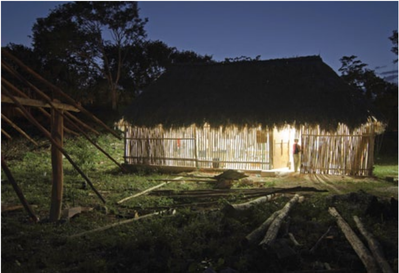
Members of the Bethania ejido, a communally-owned territory in Quintana Roo, México, have built a carpentry shop to turn their sustainably-harvested wood into finished products to sell.