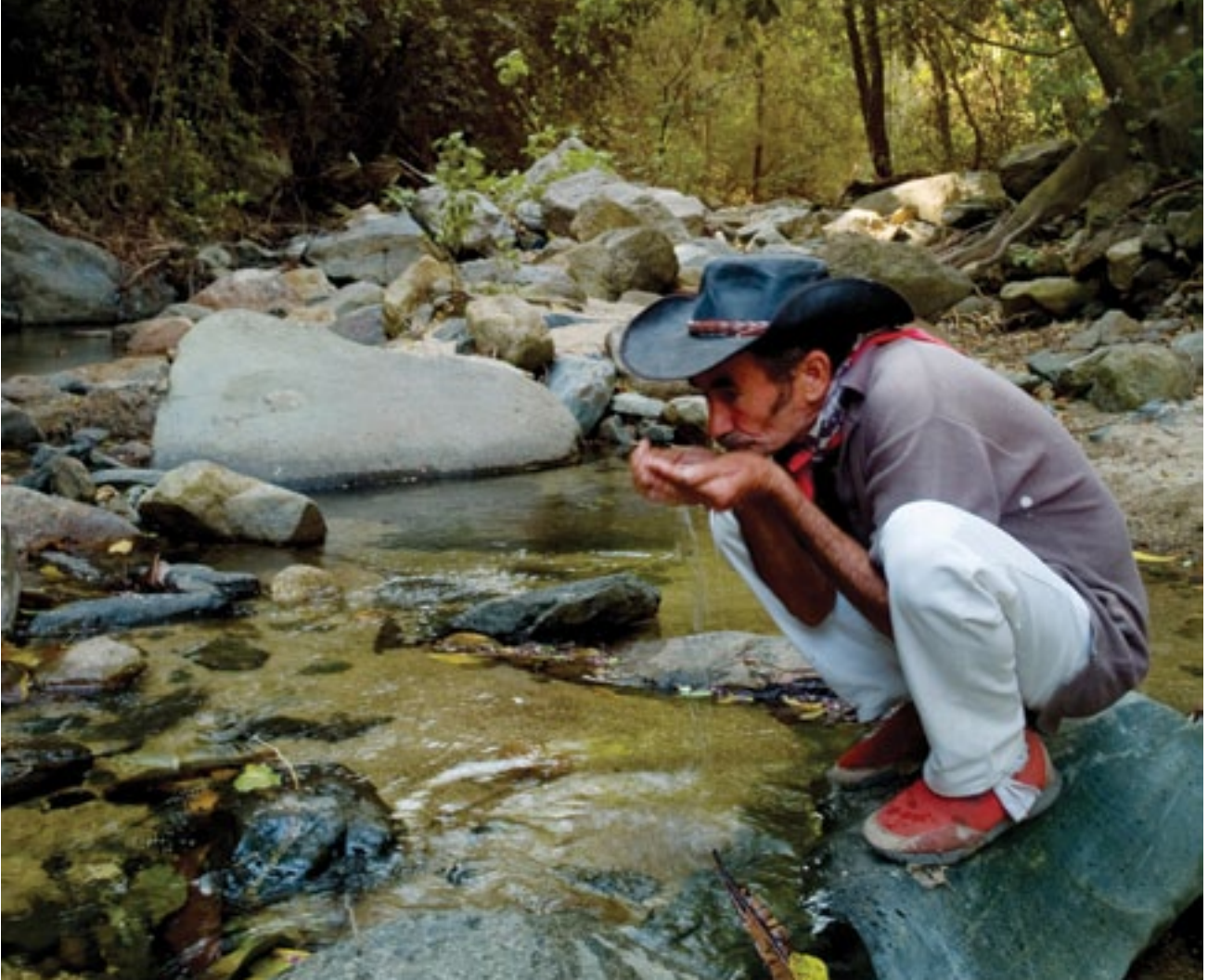
A local farmer and ecotourism guide drinks from a mountain stream that flows from Colombia's coastal mountain range, Sierra Nevada de Santa Marta, to the Caribbean sea through Tayrona National Park, which contains one of the wildest equatorial rain forests in northern South America.