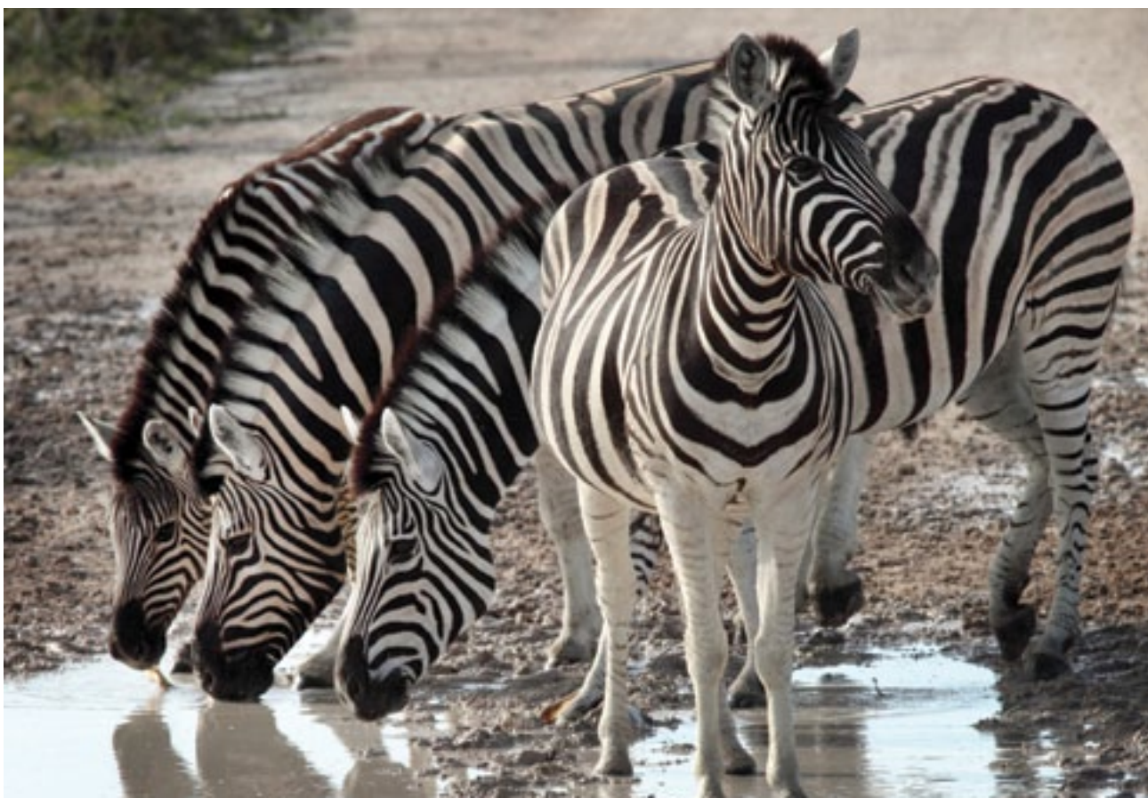
Zebras in Botswana.