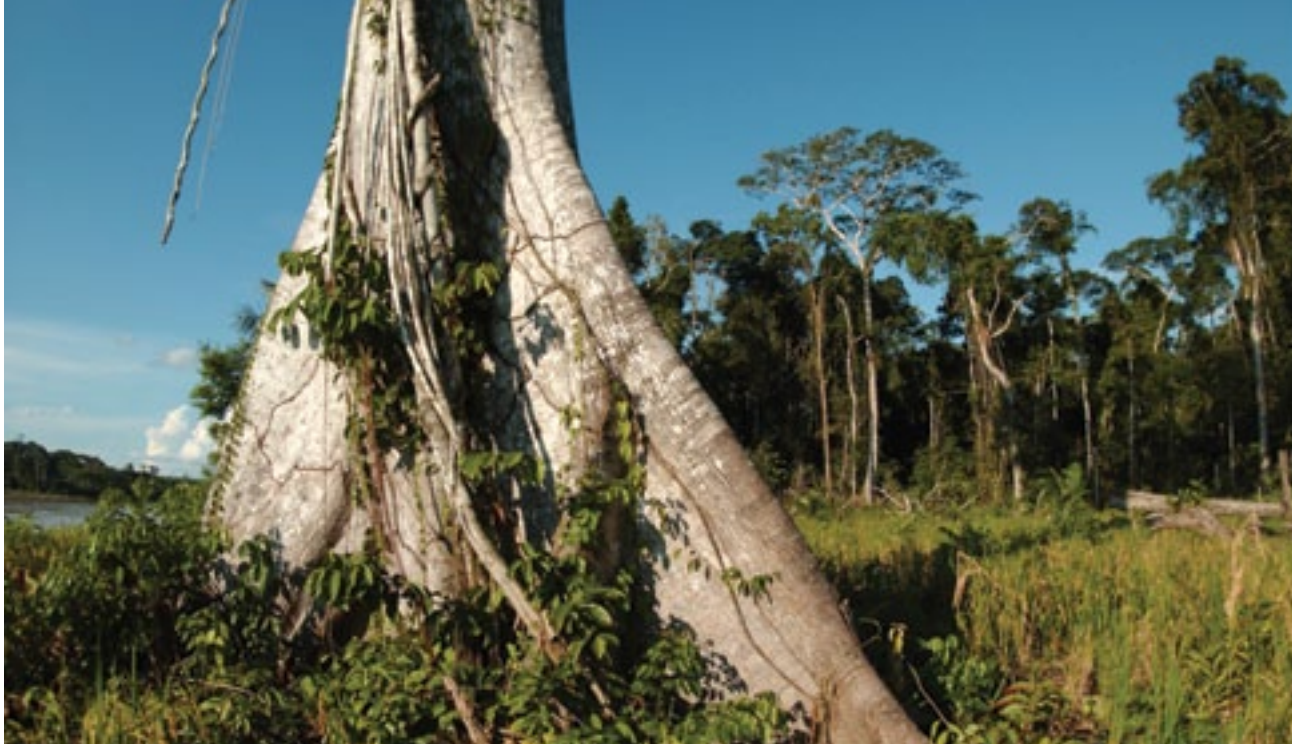
Buttress of a large rainforest tree in the Amazon watershed, Acre, Brazil.